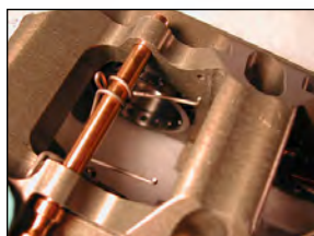
Particolare del Ponticello d'Irrigidimento Central bridge to increase stiffness.